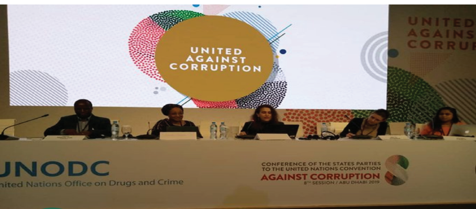
Panelists at ANEEJ side event

THE CONFERENCE OF STATES PARTIES (COSP) IS THE MAIN POLICY- MAKING BODY FOR UNCAC. IT SUPPORTS STATES PARTIES AND SIGNIATIRIES IN THEIR IMPLEMENTATION OF THE CONVENTION AND GIVES POLICY GUIDANCE TO UNODC TO DEVELOP AND IMPLEMENT ANTI-CORRUPTION ACTIVITIES