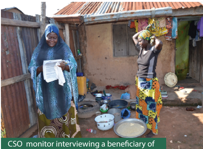
CSO monitor interviewing a beneficiary of NCTP in Nasarawa State

There was a training of Trainers workshop in Abuja, Nigeria where the supervisors and deputy supervisors were trained, who now undertook step-down training for monitors across the entire locations. Immediately after the step down training, monitors were deployed to 19 State and the FCT. The exercise also featured data verification with a total of 93 Officials from the National level, 20 States, and 55 L.G.As who are working on the National Cash Transfer Programme.