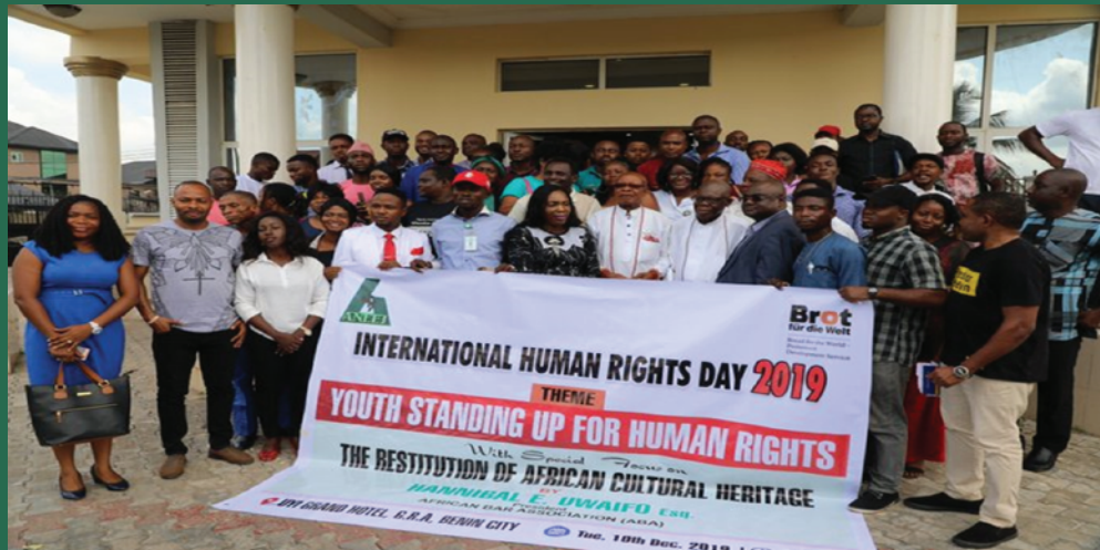
Group photograph by participants at the International Human Rights Day Event in Benin City, Edo State

ANEEJ mobilized stakeholders to mark human rights day 2019 in Benin City. The global theme was Youth Standing Up for Human Rights. Locally, the focus was on Restitution of African Cultural Heritage and a paper was presented on the topic by the president of African Bar Association. This activity was supported by Bread for the World under the Open Niger Delta project