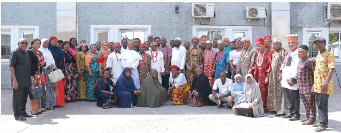
Group photograph of participants shortly after the South East town hall meeting held in Enugu, Enugu State