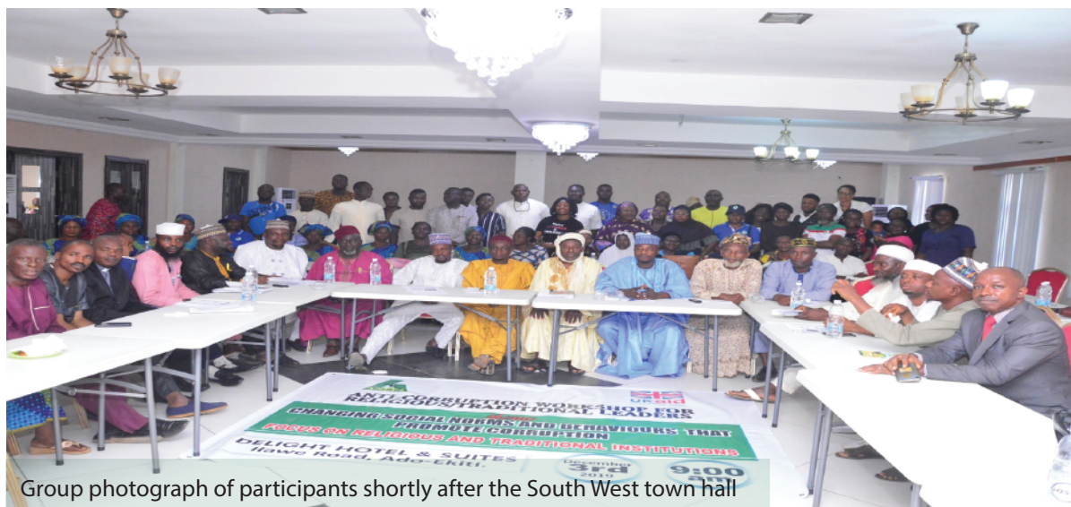
Group photograph of participants shortly after the South West town hall meeting held in Ado-Ekiti, Ekiti State

Both Town hall meetings took place in November and December 2019 and focused on the role of traditional and religious institutions in changing social norms and behaviors that promote corruption.