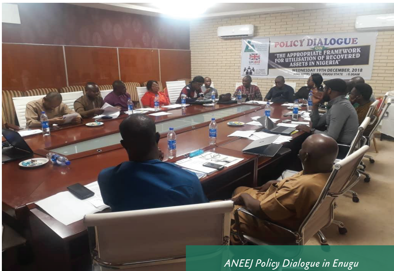
ANEEJ Policy Dialogue in Enugu