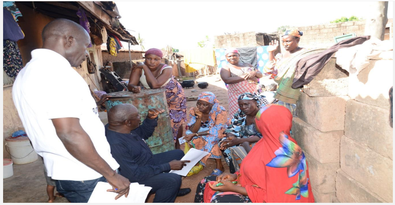
MANTRA team collating beneficiary experience on the recovered Abacha loot utilization during a monitoring exercise